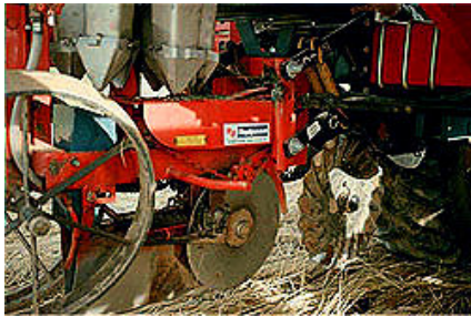
No-till transplanter unit