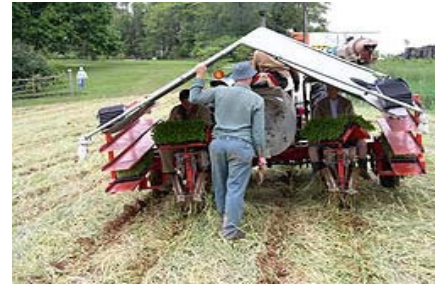
Planting into rye