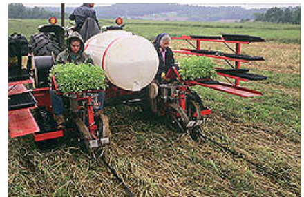
Planting in the rain: We can plant under wet conditions if necessary