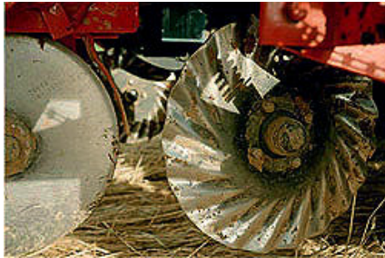
No-till coulters on RJ planter