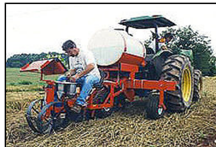
This is a 1 row custom no-till planter designed by RJ Equipment