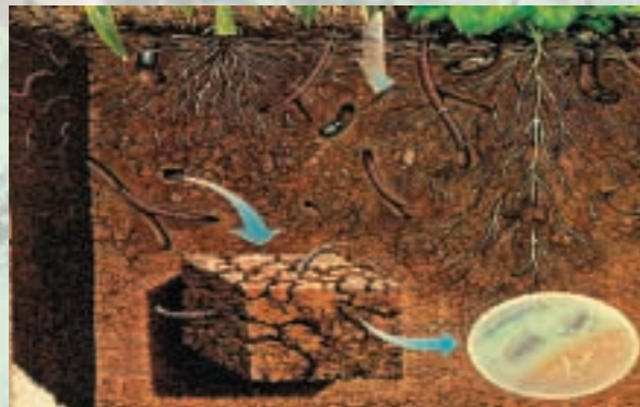
Biological tillage and soil fertility management through Conservation Agriculture

The transition phase usually takes about two years; however, the full benefits of the system often become visible only after five years. In CA, mechanical tillage is replaced by biological tillage (by crop roots and soil fauna) and soil fertility (nutrients and water) is essentially managed through soil cover management, crop rotations and weed management. Fertilizers, water harvesting technologies and irrigation can complement CA, and minimum tillage might be necessary in some cases particularly during the transition.