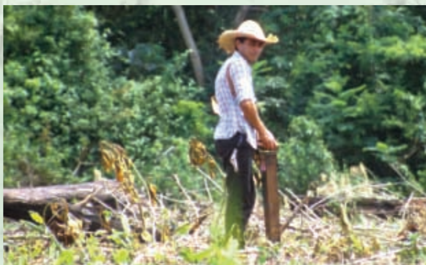
Direct seeding through crop residues: example of a hand tool