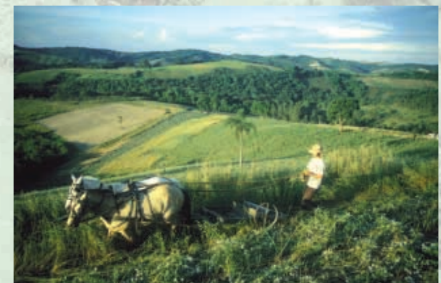
Mechanical cover crop management

Pest and disease control are based on Integrated Pest Management (IPM) technologies.