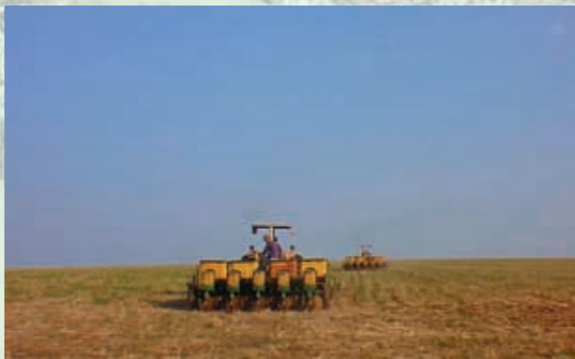
Minimal soil disturbance: direct seeding through crop residues