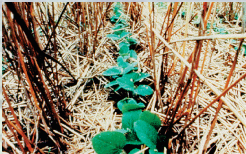
Crop rotation and permanent soil cover: soybean (crop) after black oat (cover crop and residue cover)